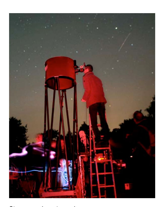
Star gazers in a star park